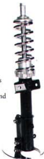
AFCO/Dynatech '10 Camaro Strut 800/632-2320 www.afabcorp.com PN: 30024

Performance-bred design in a stock-looking strut. AFCO's S197 Mustang ('05-up) strut will replace the factory unit and provide many benefits.