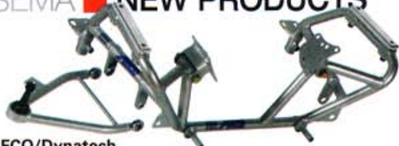
AFCO/Dynatech '79-'04 Mustang Tubular K Member 800/632-2320 www.afabcorp.com PN: 20022

Lightweight Mustang tubular K member. Available for Fox body Mustangs ('79-'93) and SN95 ('94-'04) models. A finite element stress analysis shows best weight-to-strength ratio on the market.