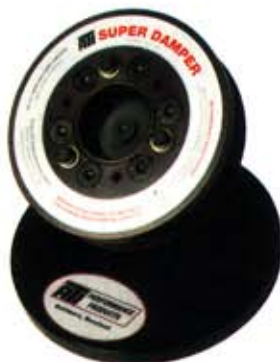
ATI Performance Products Super Damper for the Mitsubishi EVO 10 410/298-4343 www.atiracing.com PN: 918253