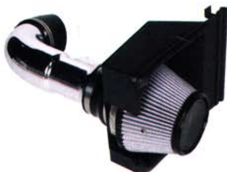
aFe-Advanced Flow Engineering Inc. Takeda Intake for Lexus IS-F 951/493-7100 www.afepower.com

High-performance strut targeted at the Camaro market. Enhance the handling of your Camaro with AFCO's road-gripping coil-over-ready strut.