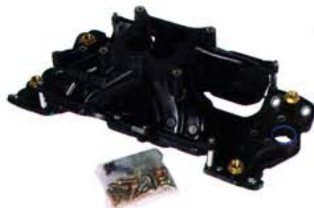
Air Flow Research TXR Modular Composite Intake 661/257-8124 www.airflowresearch.com PN: 4801

Stainless-steel long-tube headers and exhaust for V8-based engines. Mandrel-bent 1½ primaries; CNC laser-machined flanges; four-bolt ball-and-socket collectors with 3.00 X-pipe. Hardware and gaskets included.