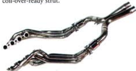
AFCO/Dynatech '11 Mustang Long-Tube Header System 800/848-5850 www.dynatechheaders.com PN: 722-74310

This intake mounts to the factory bottom intake box. This intake produced 16 hp and 15 lb.-ft. torque and outflows the factory intake by 20%.