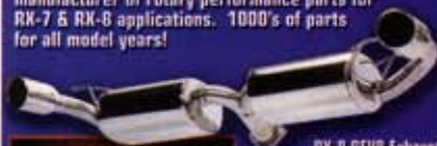
RX-8 REV8 Exhaust

Racing Beat is the world's largest manufacturer of rotary performance parts for RX-7 & RX-8 applications. 1000's of parts for all model years!