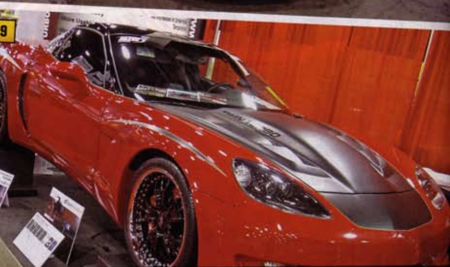
1. Sprint Booster won SEMA's coveted "Best New Performance Street Product" award 2. Injen made short work of this Infiniti G37S with loads of new gear 3. This aFe intake system uses dynamic air scoops to deliver more power for the BMW 335 4. Chris Bergemann from HorsePowerFreaks.com can be our wingman anytime! 5. Endura-Tech earned some prime real estate with this soon to be featured Subaru STI 6. Red Line synthetic lubricants continues to be trusted by thousands of tuners worldwide 7. COBB Tuning's Nissan R35 was barely recognizable at SEMA thanks to it's recent facelift 8. Straight from Australia, Drift takes aim at North American tuners 9. The proven rear-mount STS Turbo system on this custom ZR2 Vette puts down gobs of power