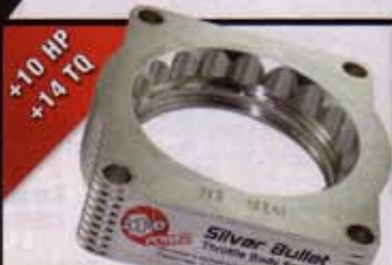
THROTTLE BODY SPACER starting at $110