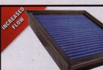
PERFORMANCE AIR FILTER starting at $70