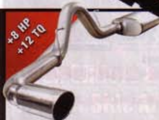
AIR INTAKE SYSTEM starting at $525