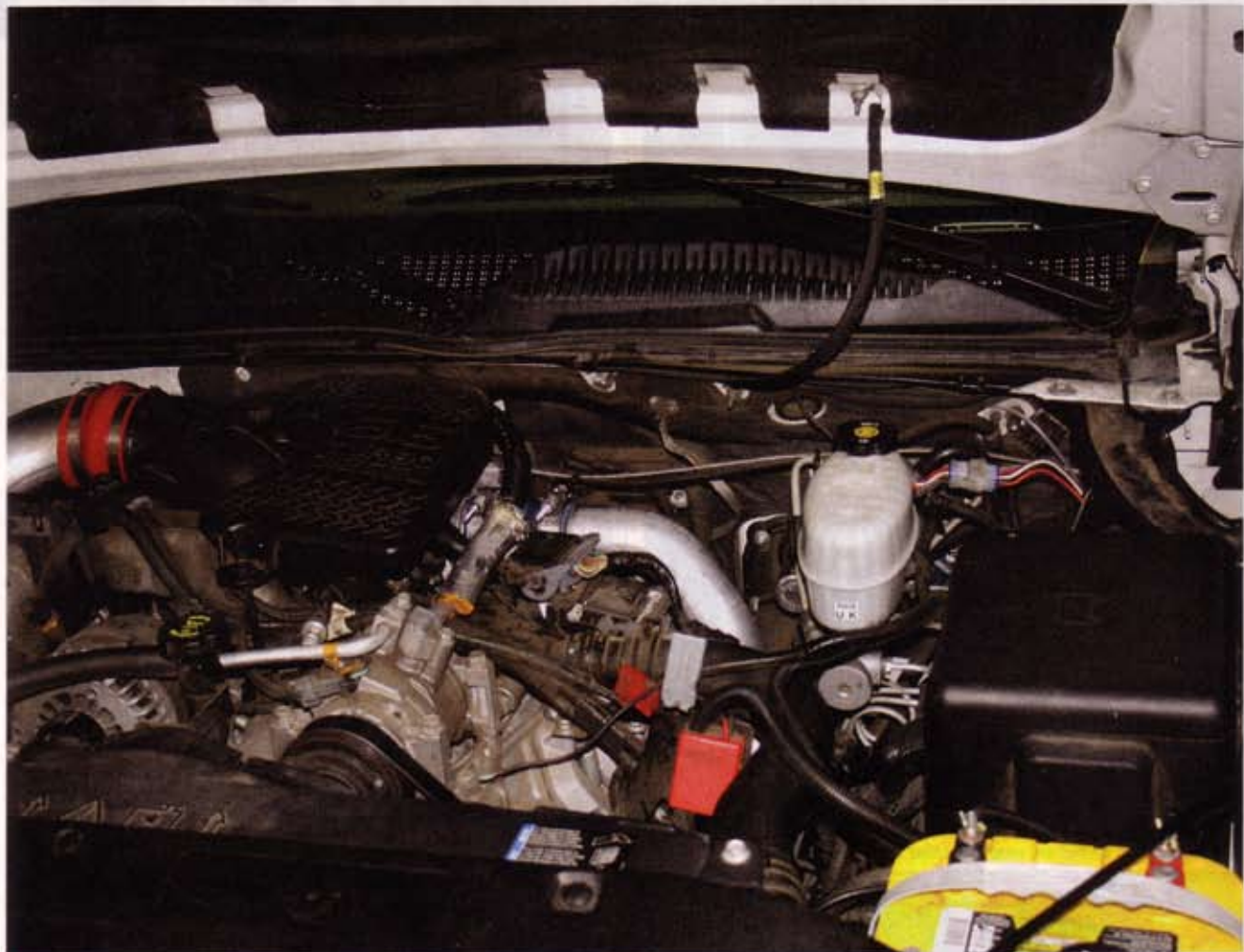
1. The stock intercooler tube on the driver side of the engine is the one that aFe's tube replaces. According to aFe, its intake tube outflows the stock unit by 67 percent.