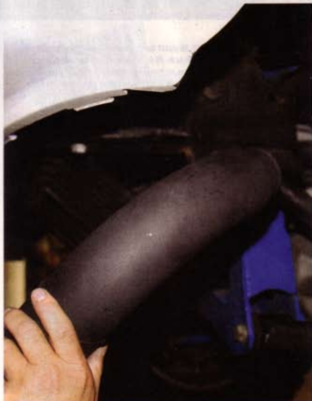
8. Install the new aFe intercooler tube through the fenderwell by carefully raising it through the fenderwell opening.