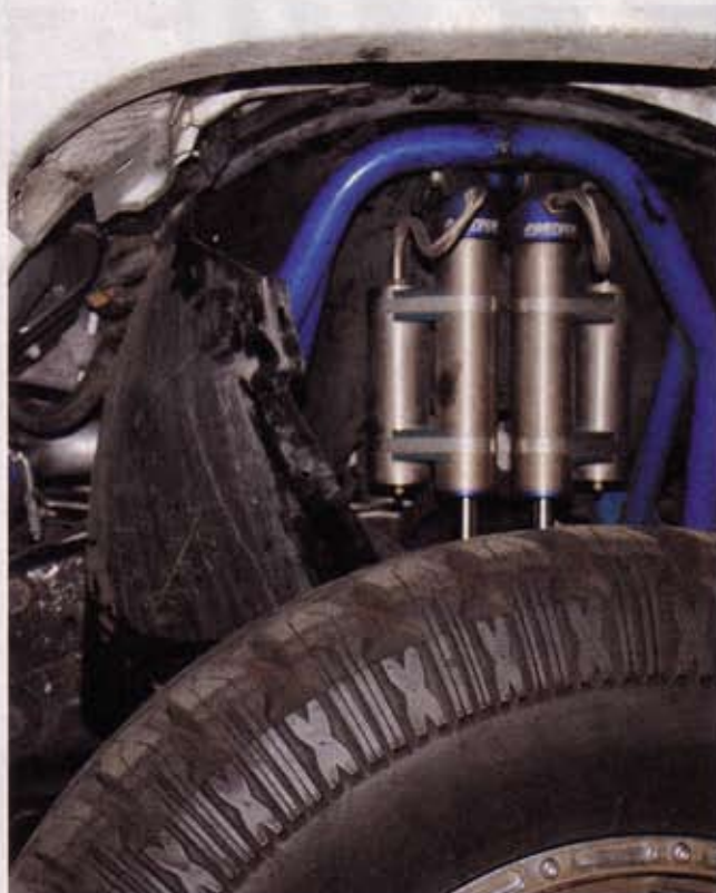
4. Pull back the fenderwell and secure with steel wire to gain access to the intercooler coupling.