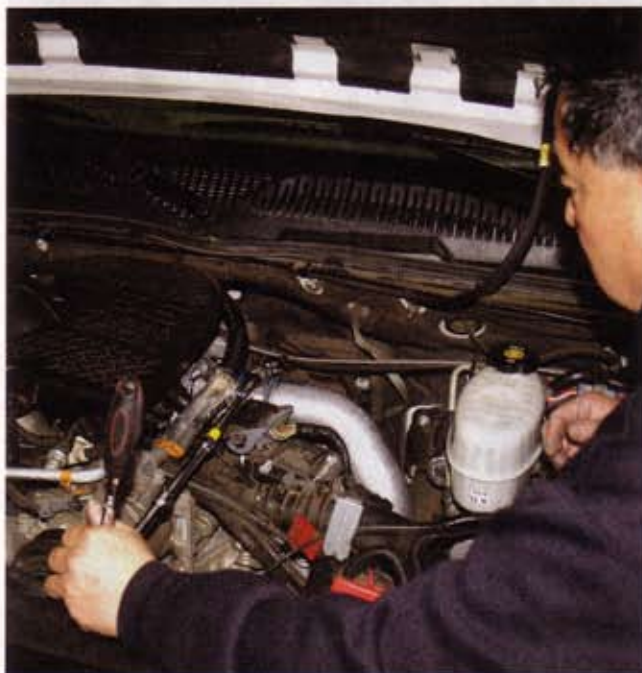
2. Loosen the clamp on the intercooler tube using a 7/16-inch-deep socket or a wrench. Take care to not damage the coupler hose that attaches to the turbo, as it will be reused with the aFe tube.