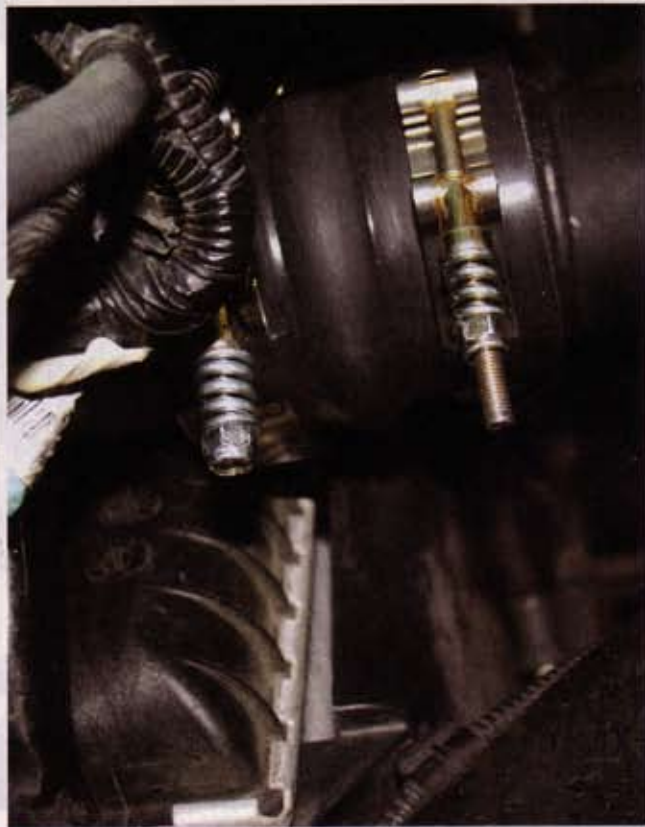
9. Install the new silicone hump coupler and clamps provide to intercooler. Do not tighten clamps so the tube can move and flex to ease installation of coupler at turbo.