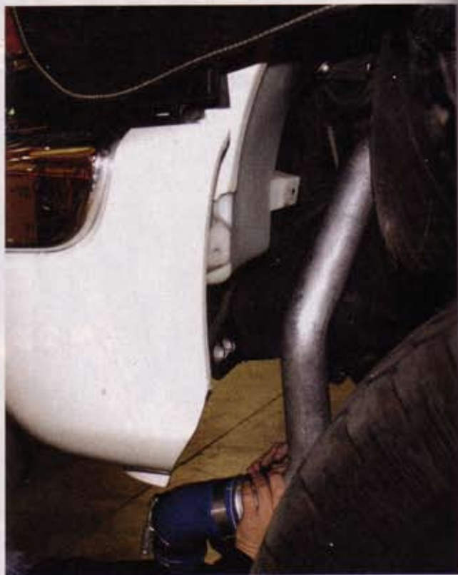
6. Remove the stock intercooler tube by lowering it through the opening in the fenderwell.