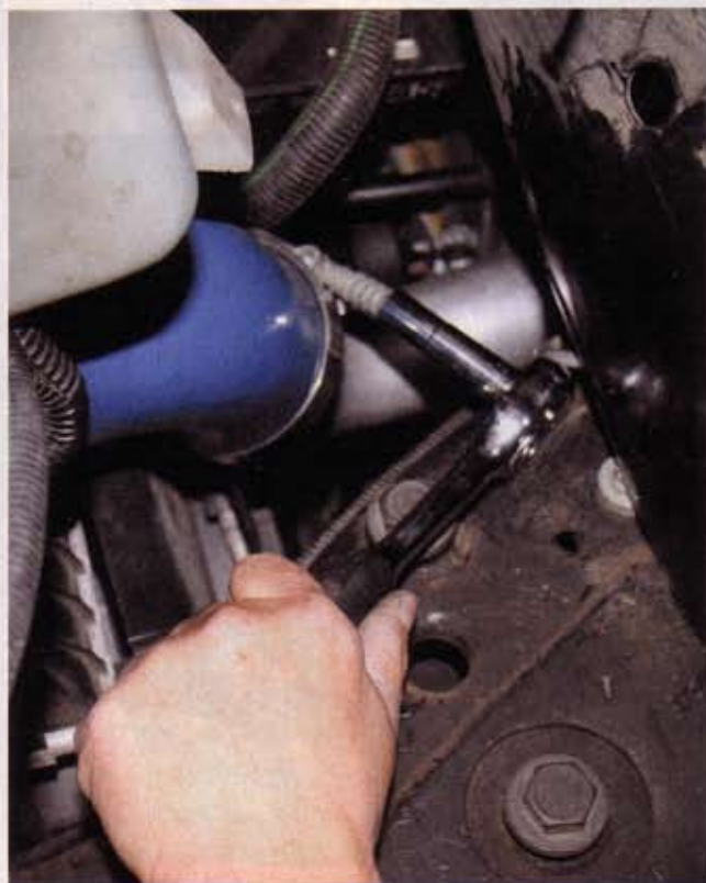
5. Loosen the clamps on the lower intake tube elbow coupler using 7/16-inch-deep socket.