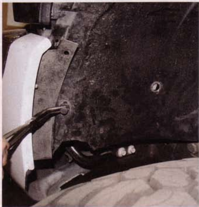
3. Remove the two pushpin fasteners by pulling up the center pin, then prying the pin assembly out, and two large head plastic fasteners that attach the driver-side fender-well forward portion.