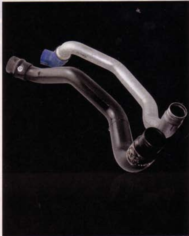
7. Side by side, you can see the differences between the stock intercooler tube and the one made by aFe.